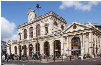
Gare Lille Flandres

There are two train stations in Lille. If you travel by train, you will definitely arrive in one of these two train stations. The two stations are within walking distance from each other (400 meters).