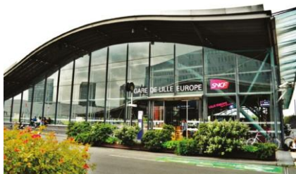
Gare Lille Europe