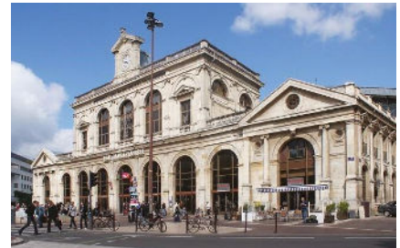
Gare Lille Europe