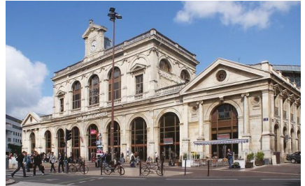
Gare Lille Flandres

There are two train stations in Lille. If you travel by train, you will definitely arrive in one of these two train stations. The two stations are within walking distance from each other (400 meters).