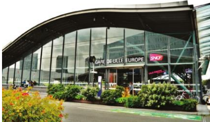
Gare Lille Europe